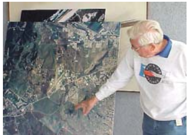
SLOPA Board Meeting