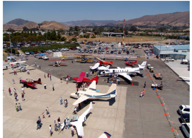
Airport Day 2005